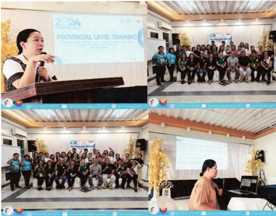
PSA Davao Oriental personnel (in action) and Trainees during the six-day Provincial Level Training for the 2024 PopCen and CBMS.

City of Mati, Davao Oriental- The Philippine Statistics Authority (PSA) Davao Oriental wraps up its successful six-day Provincial Level Training for the 2024 Census of Population (PopCen) and Community-Based Monitoring System (CBMS). This crucial training initiative, held from 10 to 15 June, has equipped our Census/CBMS Area Supervisor with the necessary skills and knowledge for the City/Municipal Level Training, and to efficiently carry out the significant data collection.