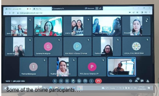
Some of the online participants...