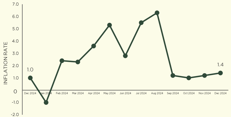
Monthly Inflation Rate for Bottom 30% Income Households in Davao del Norte: December 2023 - December 2024 (2018=100)

In December 2024, the CPI for the bottom 30% income households in Davao del Norte was 121.6.