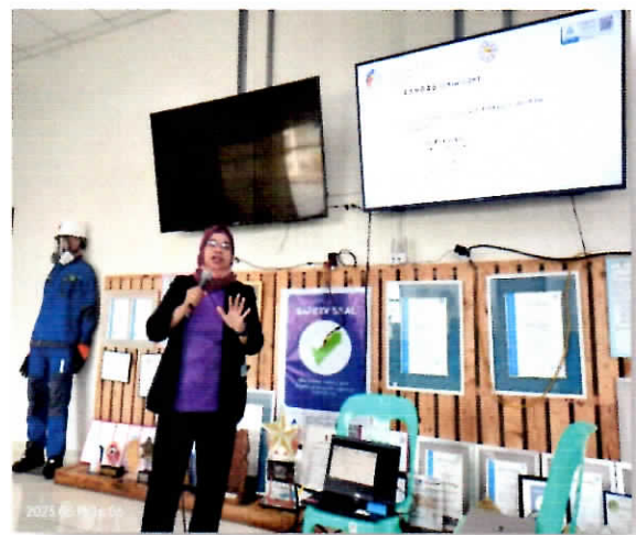
Photo 2. SSS Banto discussing the Laws Related to Civil Registration.