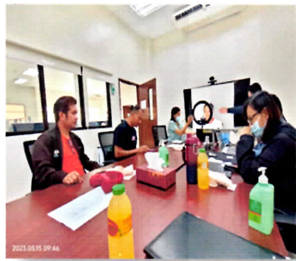
Photos 3&4. Personnel of San Miguel Consolidated Power Corporation requesting Civil Registry Documents through Batch Request Entry System and Step 2 PhilSys Registration