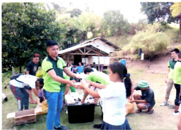
Photo 3. Distribution of food packs.