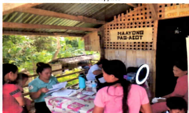
Photo 6. PBRAP Verification