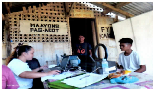
Photo 5. PhilSys Registration