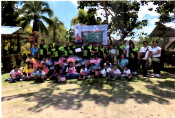
Photo 1. PSA Davao Occidental Staff together with the participating offices, students, and teachers.