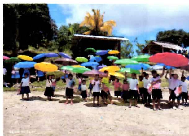
Photo 4. Students of Indigenous Filipino School of Upper Kepiya with their umbrellas and school supplies