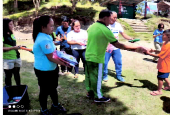
Photo 2. Distribution of school supplies and umbrellas.