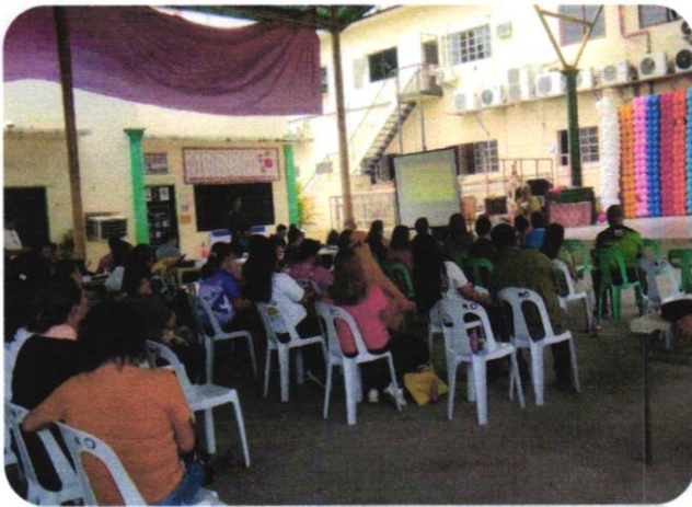
Photo 2 : SSS Banto (in front of MSMEs) briefin everyone regarding the plans, programs, and services of PSA