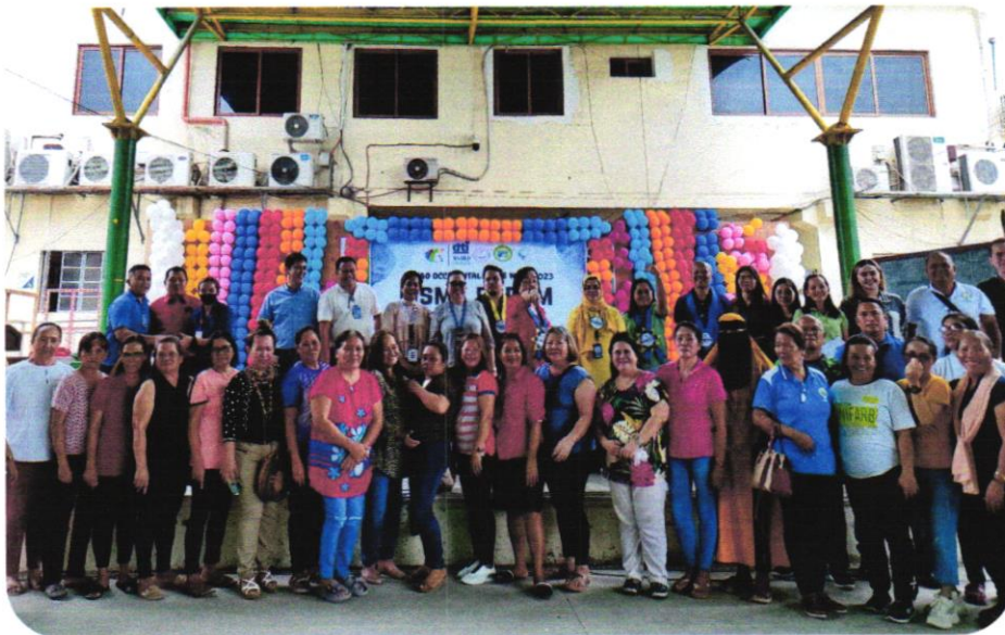
Photo 4 : Photo Opportunity of Guests, PMSMED Council Members and MSMEs Participants