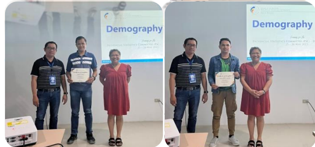
Photos 6 - 10: Awarding of Certificate of Completion to LGU Participants