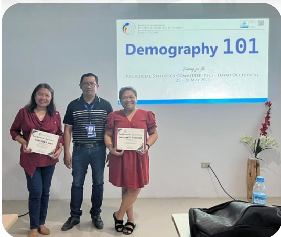
Photo 6: Awarding of Certificate of Appreciation to Resource Persons