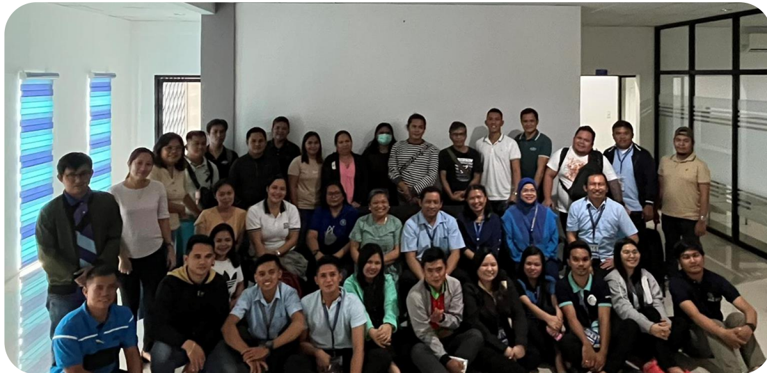
Photo 1: Photo Opportunity of all participants with PSA Davao Occidental staff and resource persons.

Date of Release: 31 May 2023 Reference No. PR-2023-025