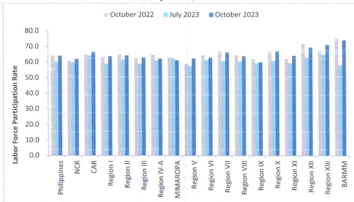
Figure 1. Labor Force Participation Rate in the Philippines, by Region: October 2022 f , July 2023 p , and October 2023 p

Notes: p - Estimates are preliminary and may change f - Final