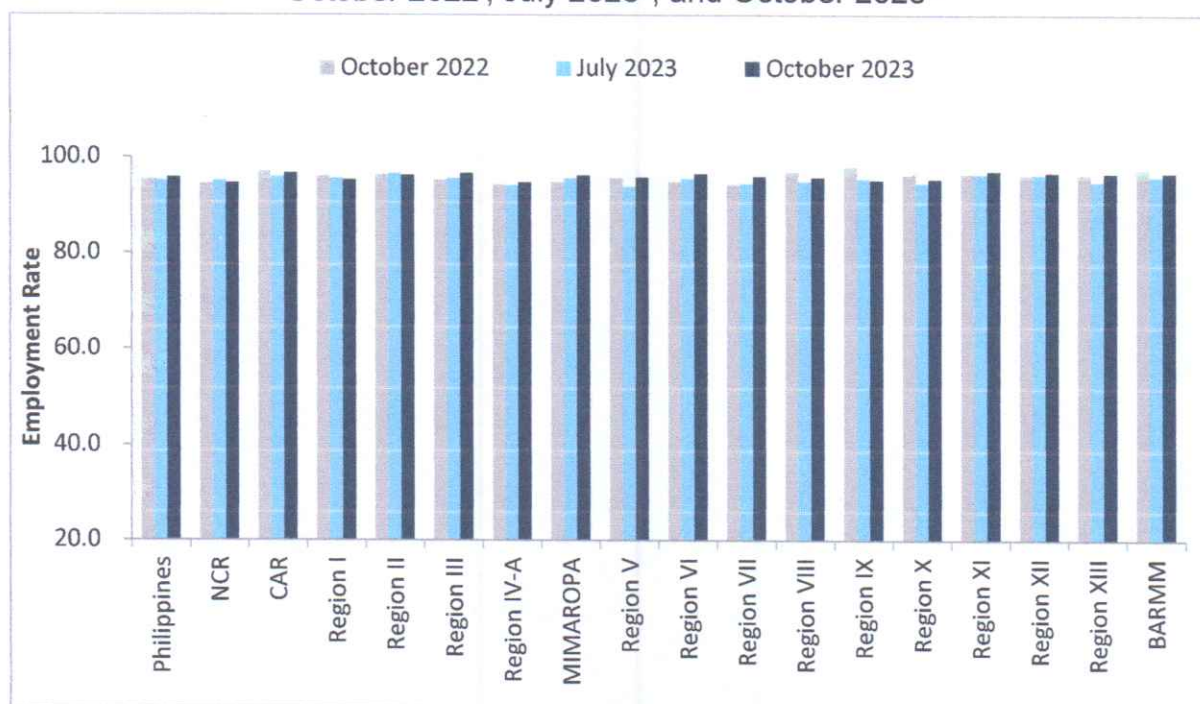
Figure 2. Employment Rate in the Philippines, by Region: October 2022 f , July 2023 p , and October 2023 p

Notes: p - Estimates are preliminary and may change f - Final