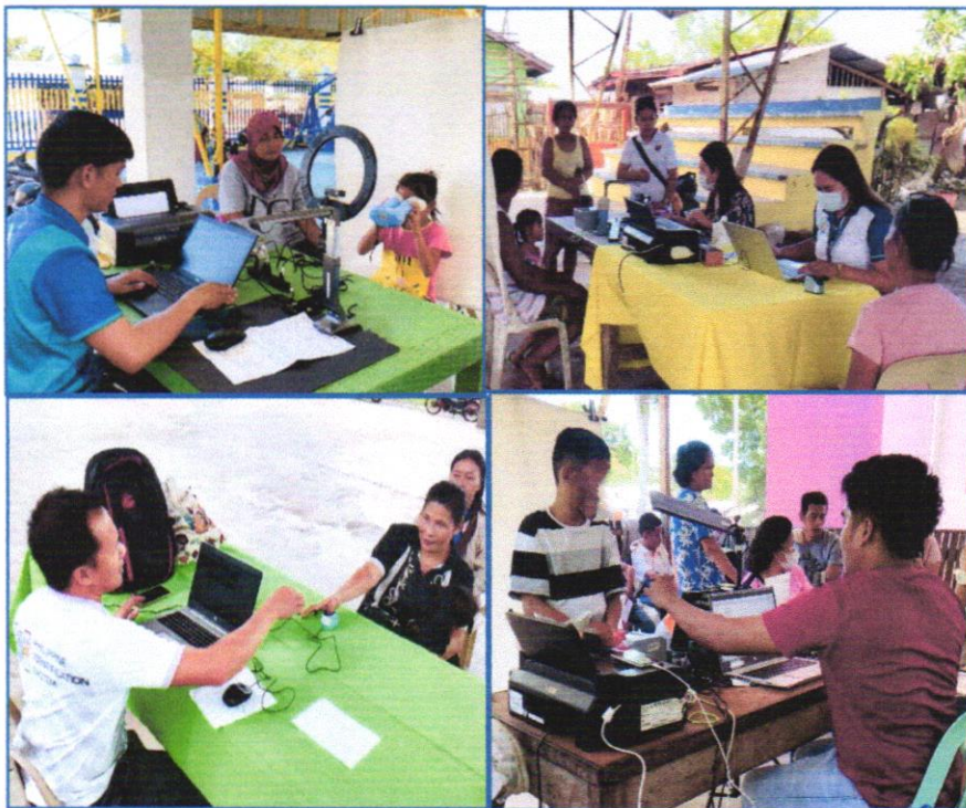
The PhilSys registration team in action during the simultaneous FDS, authentication, and PhilSys Step 2 registration activities of PSA Davao Oriental and DSWD.

Date of Release: 26 February 2024 Reference No.: PR- 1125-2024-002