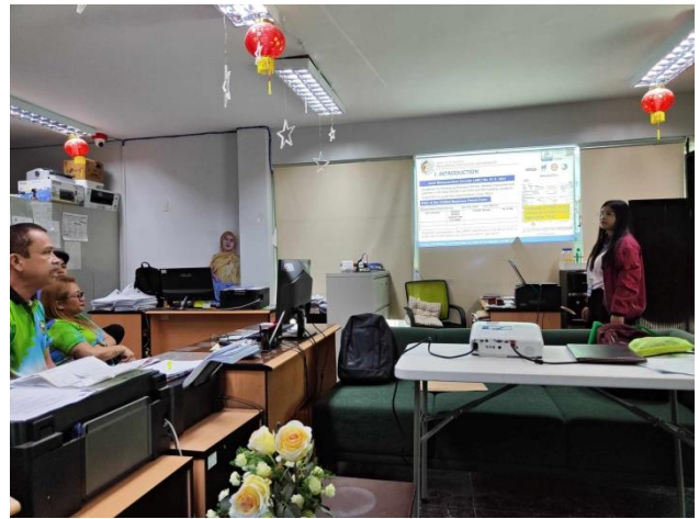
Photo 2: COSW-SA Sibla during training proper and discussion on data sharing