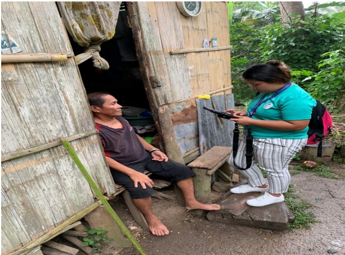
Photo 1. FLEMMS Statistical Researcher administering the Household Questionnaire through Computer Assisted Personal Interview (CAPI).

Davao Occidental Provincial Statistical Office launched the 2024 Functional Literacy, Education and Mass Media Survey (FLEMMS) data collection. As Executive Order No. 352 mandated, the survey is one of the statistical activities the government uses for critical and policy decision-making. With the Philippine Statistics Authority as the implementing agency and a member of international statistical organizations, the survey introduces a unique data questionnaire aligned with the Program for the International Assessment of Adult Competencies (PIAAC) endorsed by the United Nations Educational, Scientific and Cultural Organization (UNESCO). This unique questionnaire serves as standard tool to measure functional literacy which denotes a more advanced competency than basic literacy.