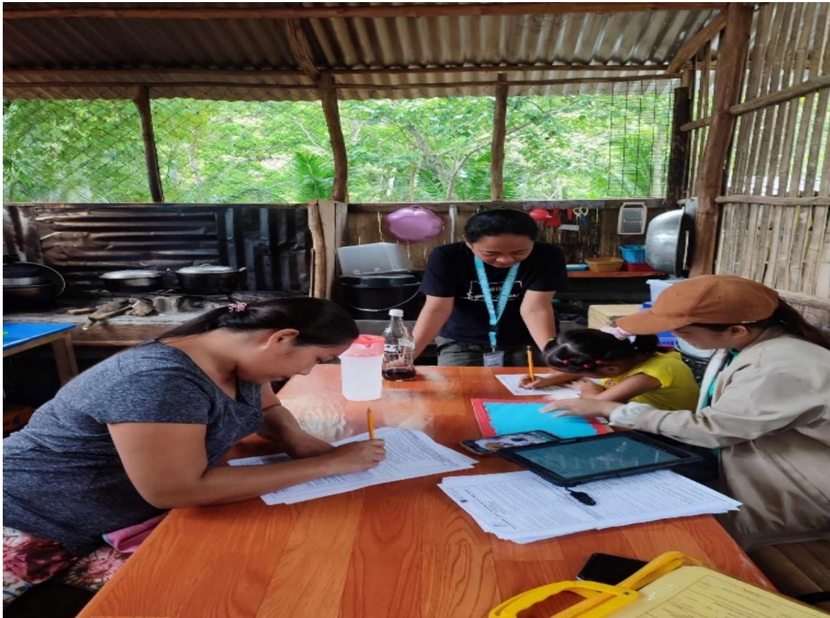
Photo 1. FLEMMS Statistical Researcher administering the Individual Questionnaire through Pen and Paper Personal Interview (PAPI).

Riding the survey are the sports, cultural and artistic activity that aims to identify the engagement of Filipinos in these fields.