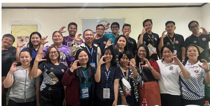
The members of the Municipal Census-CBMS Coordinating Board of Santa Maria, Davao Occidental

This collaboration between the Santa Maria LGU and the PSA demonstrates a shared commitment to using data to make informed decisions for the residents of the municipality.