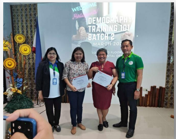
Photo 6: Awarding of Certificate of Appreciation to Resource Persons