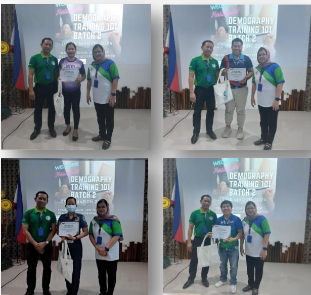
Photos 6 - 10: Awarding of Certificate of Completion to LGU Participants