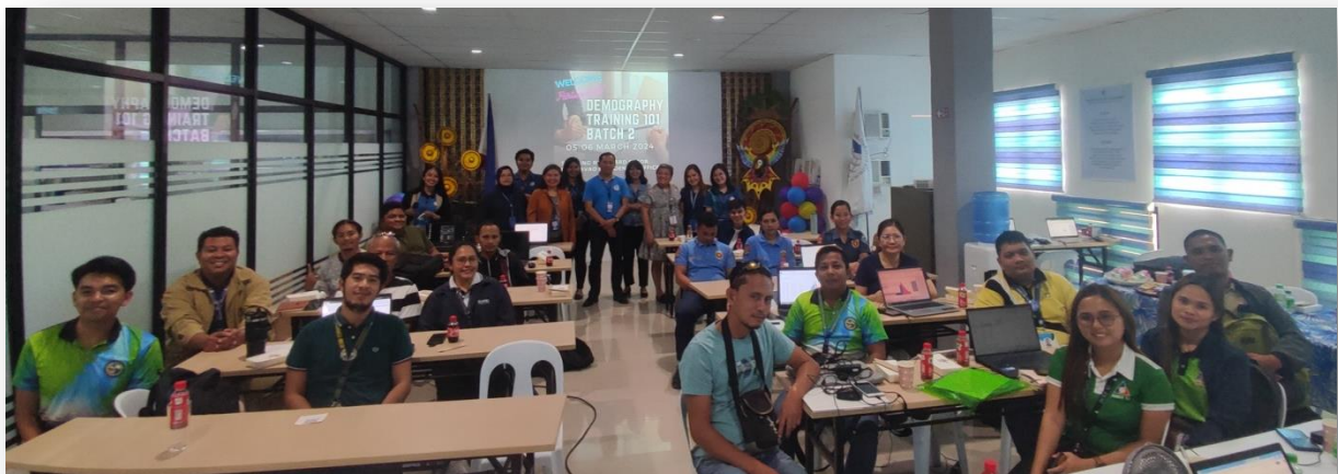
Photo 1: Photo Opportunity of all participants with PSA Davao Occidental staff and resource persons.

Date of Release: 07 March 2024 Reference No. PR-2024 - 019