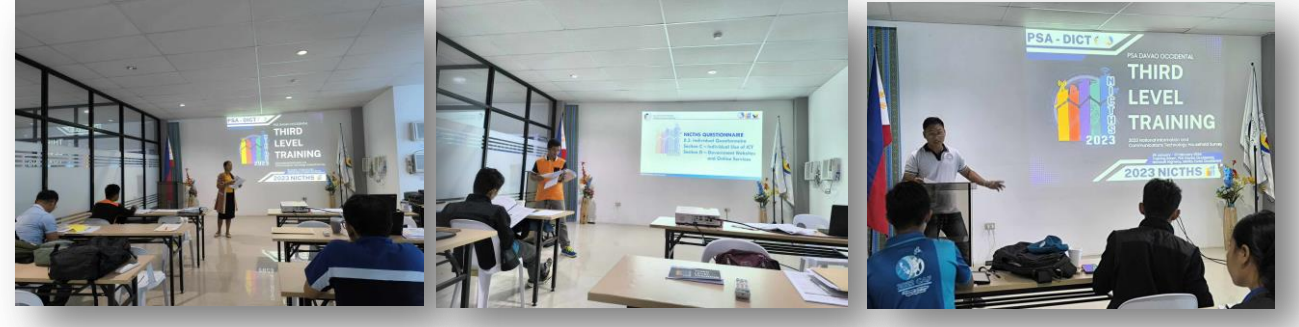
SRs sharing their insight through daily training recap prior to the start of training proper

The 2023 NICTHS is part of the larger Digital Philippines initiative of the Department of Information and Communications Technology (DICT). The implementation of the 2023 NICTHS will be handled by the Philippine Statistics Authority, mandated under Republic Act No. 10625 (The Philippine Statistical Act of 2013), as the central statistical authority of the Philippine government on primary data collection.