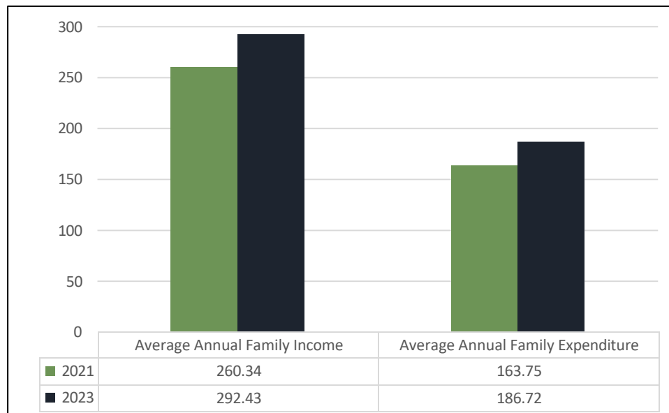
Figure 1. Davao del Sur's Average Annual Family Income and Average Family Expenditure, 2021 and 2023 p

P – preliminary