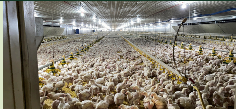
A poultry farm in City of Digos, Davao del Sur which was visited by the PSA personnel.

The field visit activity was successfully completed with the required number of farm operators from the province of Davao del Sur having been interviewed. The cooperation of the respondents and the collaborative efforts of personnel from PSA Central Office, RSSO XI, and Davao del Sur PSO contributed to the smooth conduct of the interviews and data collection, ensuring the quality and relevance of the gathered inputs for the PSNA.