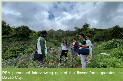
PSA personnel interviewing one of the flower farm operators in Davao City.