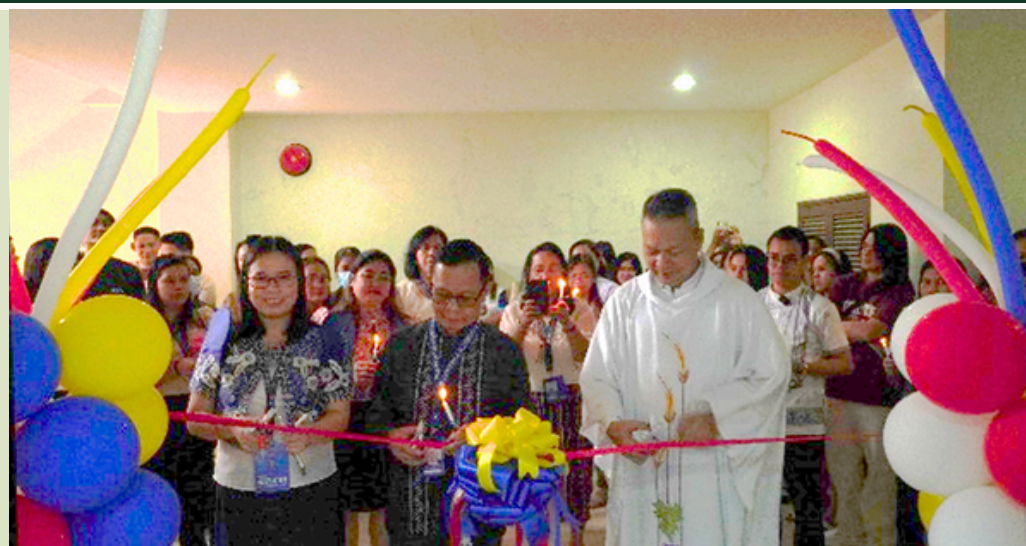
(CSS) OIC Gales and (SSS) OIC Batucan lead the ribbon-cutting ceremony with the parish priest.

PSA Davao del Sur Provincial Statistical Office officially inaugurated its additional office space located on the 2 nd Floor of JM Agro Building, Gov. Sales St., Davao City on 19 May 2025 (Monday). With the inauguration of its additional office space, the agency reaffirms its dedication to excellence in public service, embracing innovation, collaboration, and transparency as it continues to serve the Filipino people with integrity and purpose.