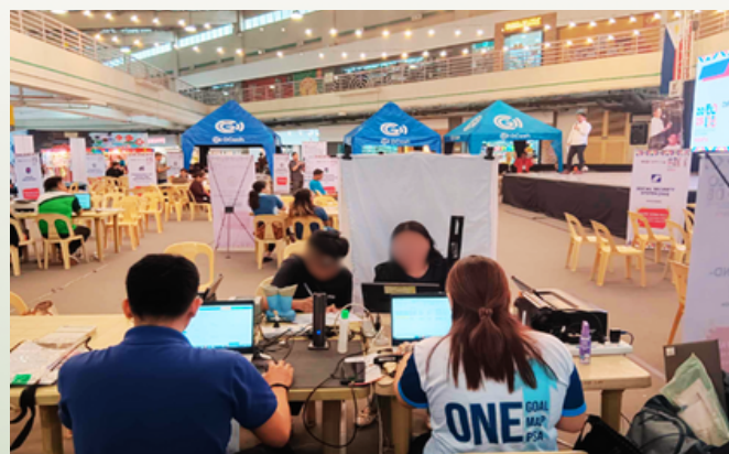
Registration Kit Operators (RKO) of PSA Davao del Sur in providing National ID registration assistance to the public.

A total of 18 individuals were successfully registered in the National ID System during the activity.