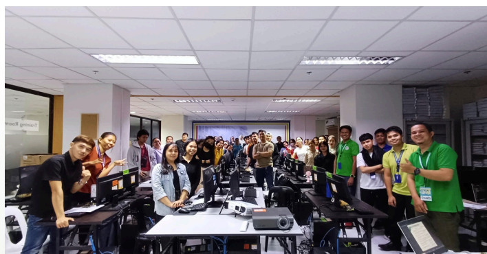
SA Milgo (Focal Person) together with the 2024 POPCEN-CBMS personnel after the completion of data validation.

The next phase of the project will focus on finalizing the map data validation for City of Davao. It will also involve the review and deletion of household members who were double counted, with the PSA Central Office determining their correct province for retention.