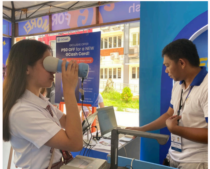
PhiSys Registration Kit Officer assists student registrant during the NID registration process

To increase information awareness, PSA Davao del Sur encourages individuals to register at various locations: the PSA Fixed-Registration Center at PSA Cabaguio Ave., SM City Davao, PSA Sales St., and the PSA Civil Registry System (CRS) Digos Outlet. This effort is part of the agency's push to ensure more citizens are registered and can benefit from the National ID system, particularly in essential transactions.