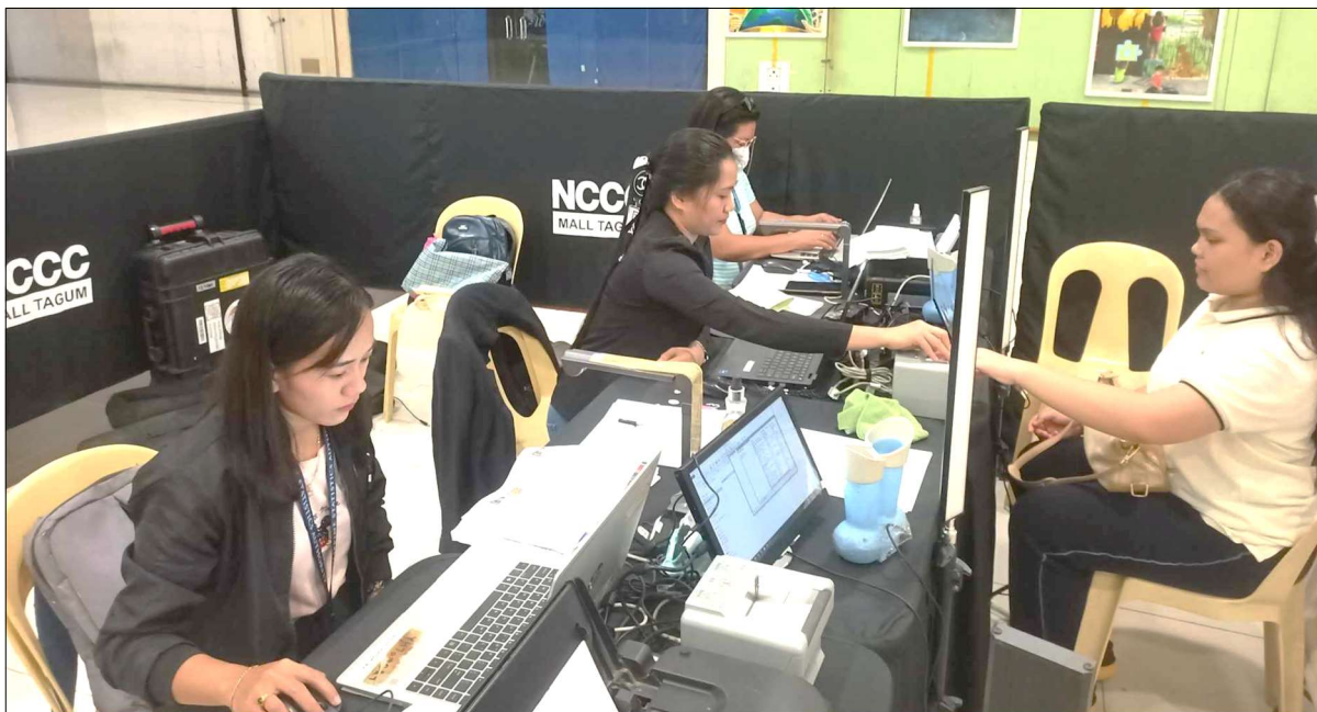
17 February 2024, PhilSys Registration Team set-up the PhilSys Mobile Registration at NCCC Mall, City of Tagum, Davao del Norte

The initiative comes to an objective in providing a secure and efficient national identification system for all Filipinos and resident aliens. By setting up mobile registration booths in shopping malls, PhilSys hopes to reach a broader demographic and streamline the registration process.