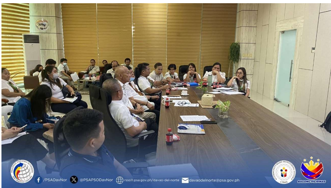
CSS Amoyen together with the CCB of the City of Tagum discussing the overview of the 2024 CBMS

The 2024 Community-Based Monitoring System (CBMS) was officially convened with the CBMS Coordinating Board of the City of Tagum at City Hall, J.V. Ayala Avenue, Apokon Road, Tagum City on 26 th of February 2024.