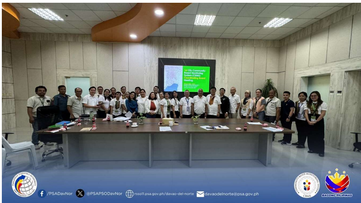
Wrapping up the meeting with CCB of the City of Tagum and PSA PSO Davao del Norte personnel.

Ultimately, the convening of the 2024 CBMS is a testament to the collective commitment to building a brighter, more equitable future for all. By embracing the principles of participatory governance and leveraging the power of data, drive inclusive development, and pave the way for sustainable change.