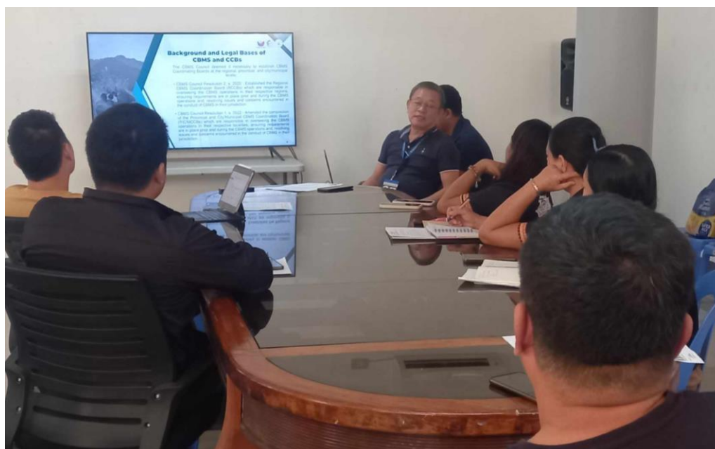
CSS Amoyen discussing the Background and Legal Bases of CBMS and CCBs

Moreover, CBMS provides LGUs with reliable, evidence-based data to inform policy formulation, resource allocation, and monitoring of development initiatives. LGUs can gain a deeper understanding of the diverse challenges and priorities within their jurisdiction. The grassroots participation not only promotes transparency but also ensures that policies and programs are tailored to meet the specific needs of local communities.