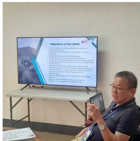
CSS Amoyen discussing the objectives of the 2024 CBMS

It was discussed also the objectives of the 2024 CBMS, on establishing a data base through a work-leg data collection. Data sharing is allowed through information management system with respect to the fundamental human right to privacy, ensure data quality, and uphold data protection; principles of legitimate purpose, transparency, and proportionality.