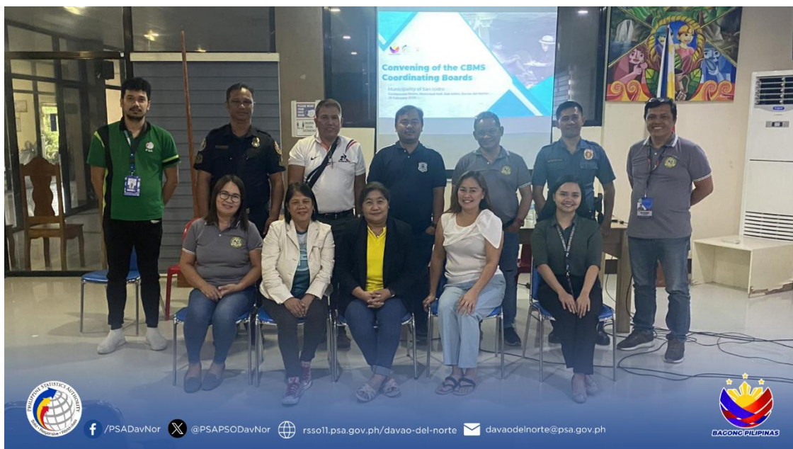
PSA PSO Personnel together with the MCCB San Isidro during the 1 st convening of the 2024 CBMS

It was also discussed the Scope and Coverage of the 2024 Community-Based Monitoring System (CBMS), one of the coverage was the 2024 CBMS operations shall be a comprehensive enumeration of all households and geotagging of all service facilities, and government projects in the locality. The implementation shall also cover capacity strengthening activities for local government units for their proper management and utilization of the CBMS data.