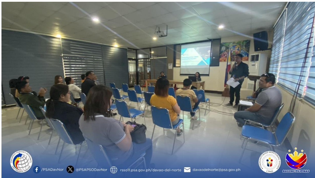
Members of the CCB of the Municipality of San Isidro discussing about the 2024 CBMS preparations.

The 2024 Community-Based Monitoring System (CBMS) was officially convened with the CBMS Coordinating Board of the Municipality of San Isidro at Municipal Hall, San Isidro, Davao del Norte last 28 th of February 2024.