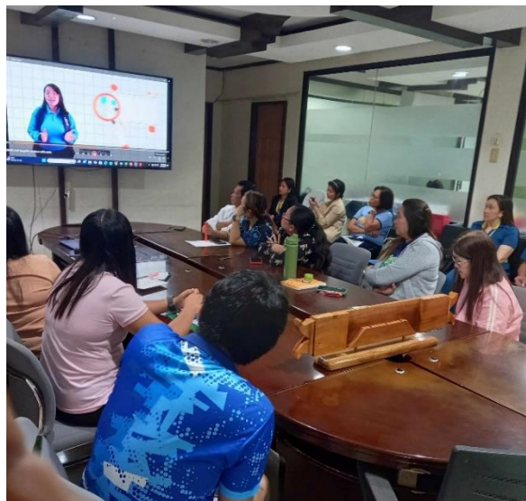
Members of the CCB Braulio E. Dujali watching the CBMS AVP

It was also discussed the Scope and Coverage of the 2024 Community-Based Monitoring System (CBMS), one of the coverage is for the 2024 CBMS implementation, the PSA aims to cover all 1st to 6th income class cities and municipalities in the country, and those with no income classification yet. Furthermore, the roles and responsibilities of the CBMS Coordinating Board was also discussed and they actively participated throughout the convening.