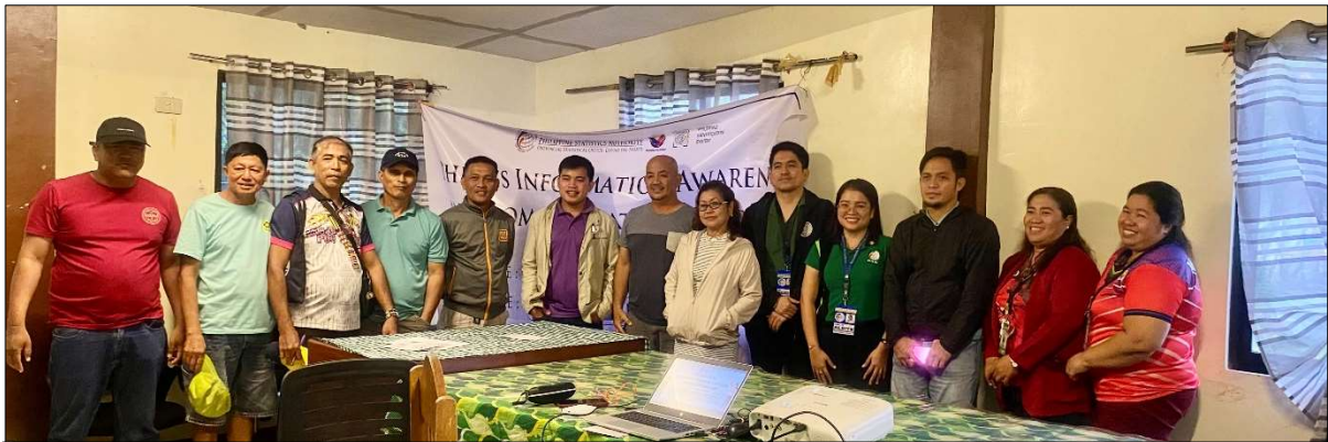
Barangay Officials of Barangay Balagunan, Municipality of Santo Tomas with the PSO-DavNor Staff and the Municipal Civil Registrars' Office Staff

Additionally, PhilSys Information Awareness Campaign also involves the participation of the Local Civil Registry Offices, as the partner of PSA in the implementation of civil registration services.