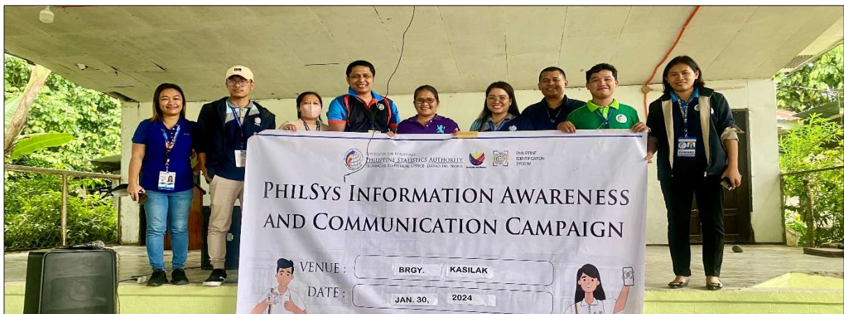
PhilSys Information Awareness and Communication Campaign at Barangay Kasilak, City of Panabo with the Barangay Captain and the Staff of City Civil Registrars' Office

Additionally, PhilSys Information Awareness Campaign also involves the participation of the Local Civil Registry Offices, as the partner of PSA in the implementation of civil registration services.