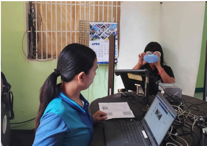
22 April - National ID Mobile Registration at Barangay San Roque, City of Panabo

This initiative supports the PSA and LCRO's mission to bring essential civil registry and National ID registration services closer to the community. By holding registration activities at the barangay level, the program aimed to assist unregistered individuals facing challenges in reaching fixed registration centers due to time constraints or geographical limitations.