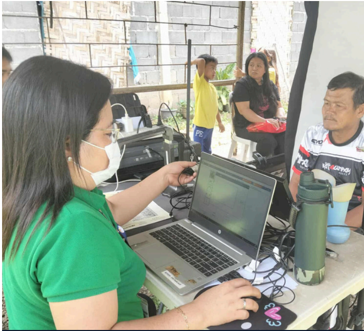
02 April - National ID Mobile Registration at Barangay Katualan, City of Panabo

The PSO-DavNor actively responded to various invitations from the Civil Registrar's Office to conduct National ID registration outreach across the province.