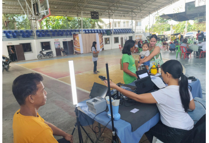
28 April - National ID Mobile Registration at Barangay New Visayas, City of Panabo

To facilitate the process, PSO DavNor deployed its National ID Mobile Registration Team, ensuring convenient and efficient registration for residents. Additionally, the activity included the issuance of the National ID in Paper Form, allowing registrants to receive their ID while awaiting the physical card.