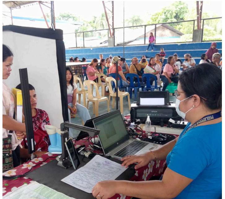
22 April - National ID Mobile Registration at Barangay Magdum, City of Tagum

This initiative supports the PSA and LCRO's mission to bring essential civil registry and National ID registration services closer to the community. By holding registration activities at the barangay level, the program aimed to assist unregistered individuals facing challenges in reaching fixed registration centers due to time constraints or geographical limitations.