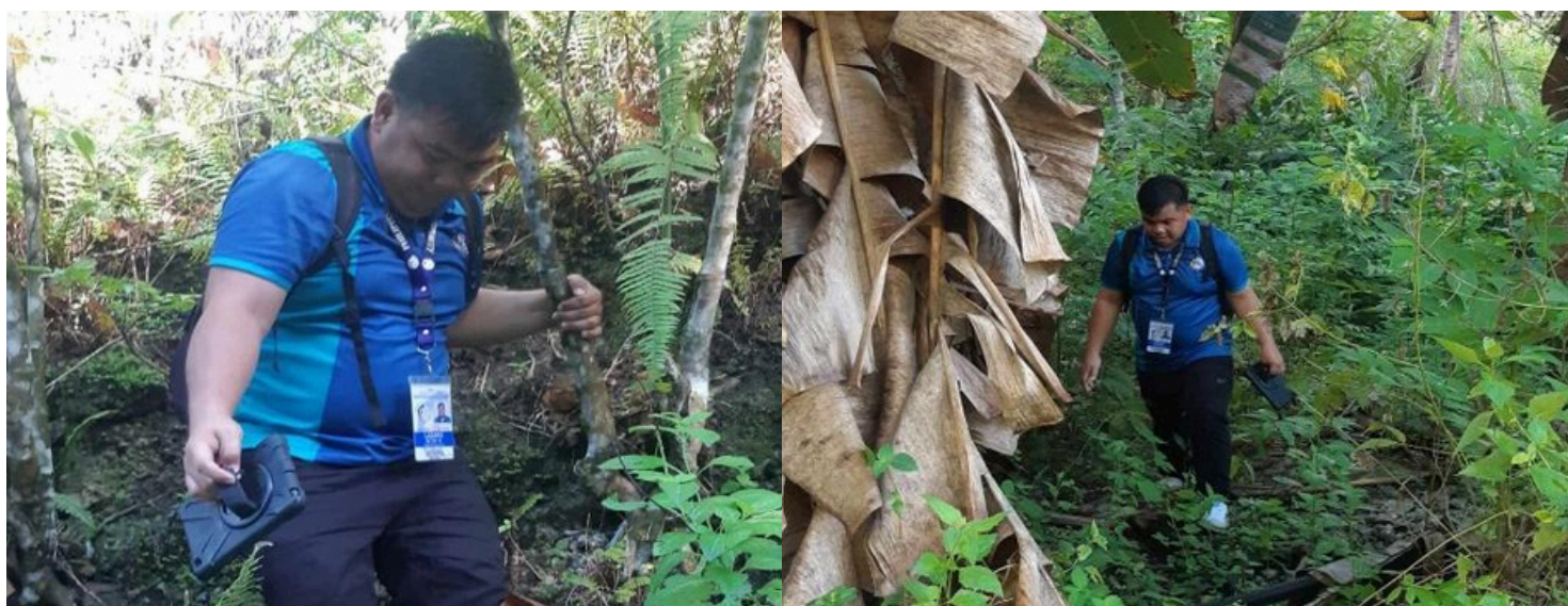
Statistical Researcher on the way to a sample household located in a remote and rugged area in Barangay Tagbay, Island Garden City of Samal

Field enumeration from April 8 to 30 was marked by strong community cooperation and adaptive strategies. SRs tackled challenges such as remote household verification and clarifying sensitive questions, ensuring data accuracy through respectful engagement and real-time supervision.