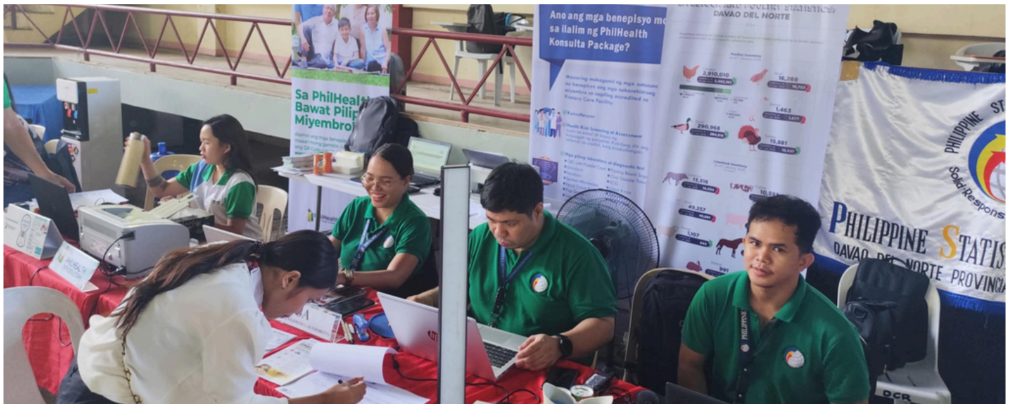
National ID Unit assisted the National ID Mobile Services at USeP Tagum City

TAGUM CITY, Davao del Norte – The PSO – Davao del Norte, National ID Unit actively participated in the Career Fair organized by the University of Southeastern Philippines (USeP) Tagum-Mabini Campus, held on 07 May 2025 at the PECC Gymnasium, Barangay Apokon.