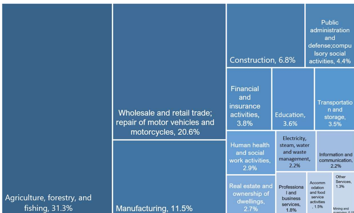
Figure 3. Percentage Share of Industries to GDP of Davao del Norte, 2022 at Constant 2018 Prices