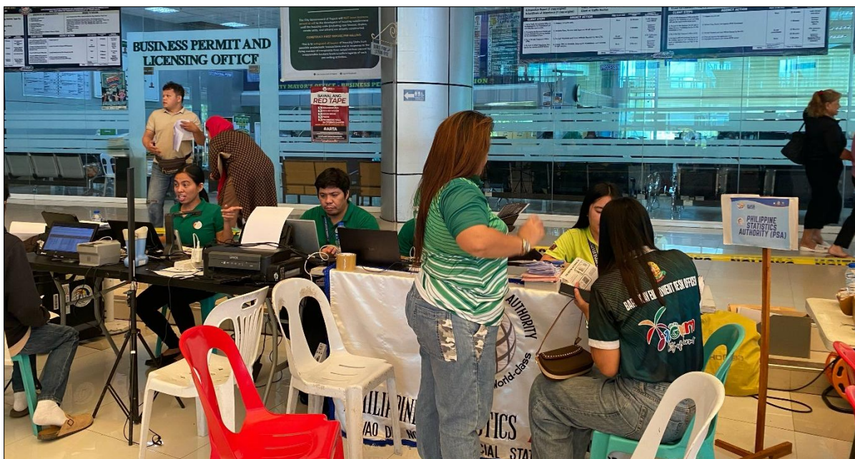
The assistance in accessing the Digital National ID and providing assistance on Civil Registry concerns