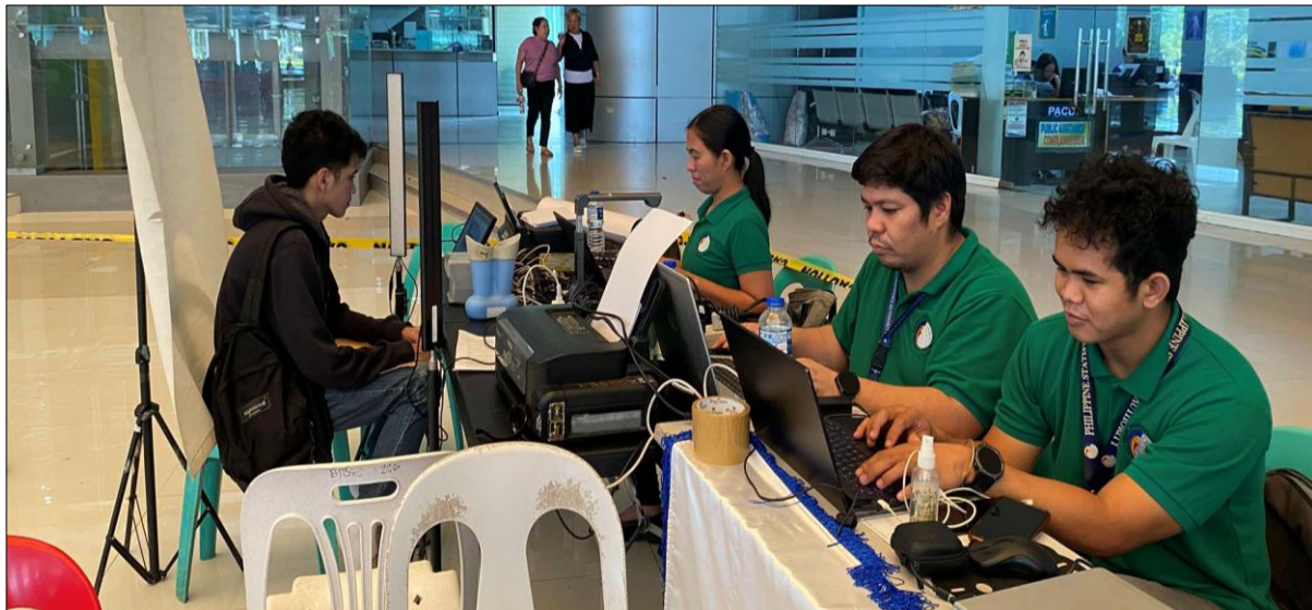
The registration in the National ID System for first time job seekers at the 123 rd Labor Day Job Fair

As part of its continuing efforts to bring essential government services closer to the people, PSA-PSO DavNor offered a suite of services during the activity, including: