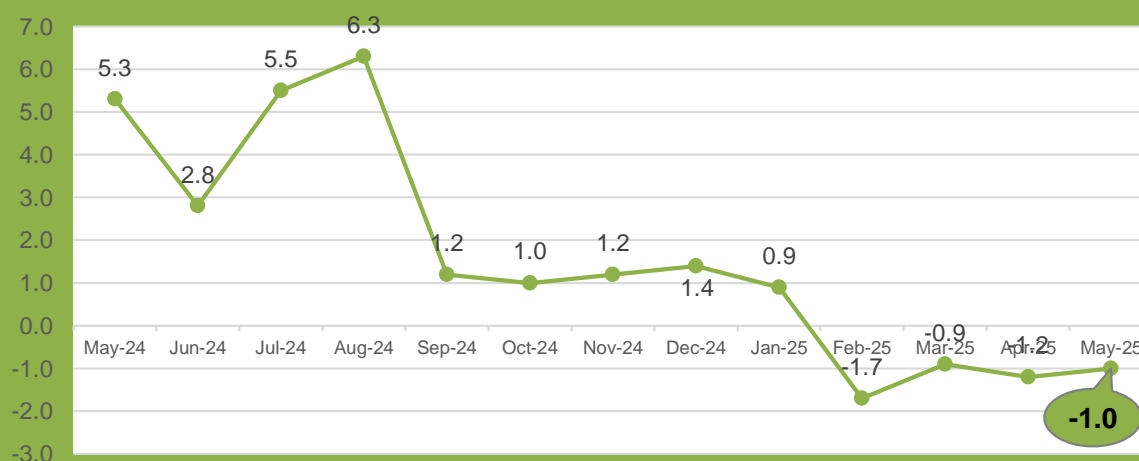
Figure 1. Inflation Rates for the Bottom 30% Income Households in Davao del Norte, All Items (2018=100)