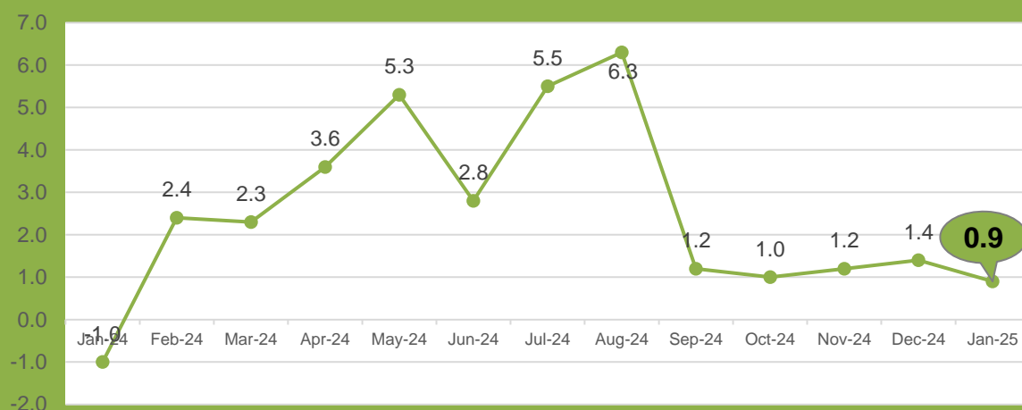
Figure 1. Inflation Rates for the Bottom 30% Income Households in Davao del Norte, All Items (2018=100)