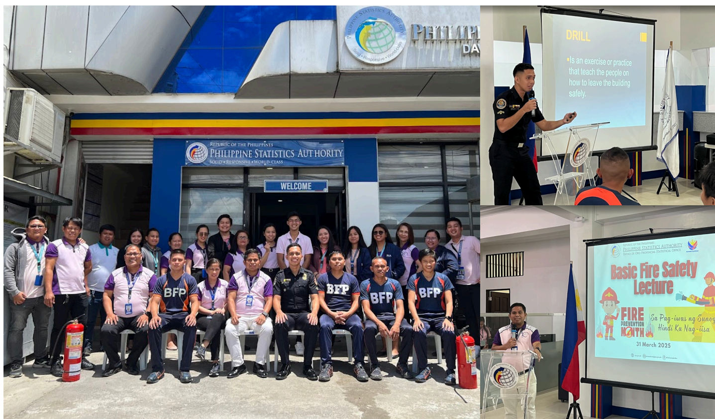
Snapshots during the Basic Fire Safety Lecture and Drill last March 31, FO 2 Polestico(Upper right) and CSS Gulay(Lower right)

In observance of Fire Prevention Month, the Philippine Statistics Authority (PSA) Davao de Oro, in partnership with the Bureau of Fire Protection (BFP) Nabunturan Fire Station, successfully conducted a Basic Fire Safety Lecture and Drill on March 31, 2025.