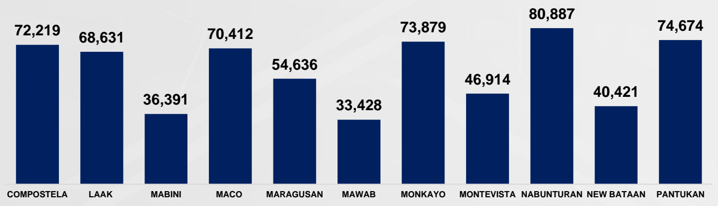
Figure 1. Number of Registered Individuals per Municipality: Davao de Oro As of 31 March 2024

The Municipality of Nabunturan recorded the highest number of registrants at 80,887 individuals while the Municipality of Mawab posted the lowest count of registered individuals at 33,428.