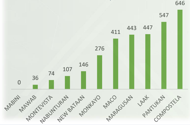
ePhilID Distribution Output For the Month of April 2023

The highest number of ePhilID distributions output was recorded in the Municipality of Compostela with a total of 646 , while the Municipality of Mabini had no distribution output.